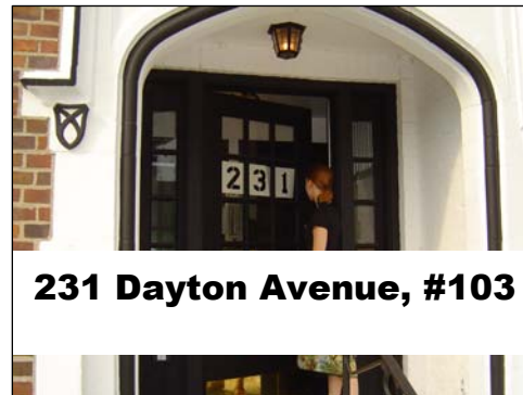
231 Dayton Avenue, #103